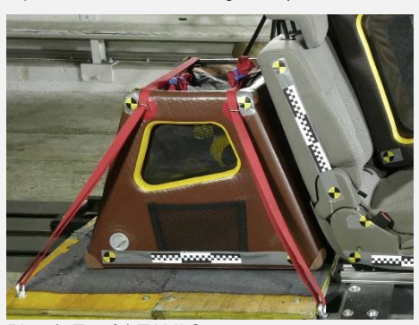
Pict. 1: Test01 TAMI S

Test setup Test01: TAMI S placed in trunk simulated by wooden plates and carpet behind Renault Espace IV second seat row (consisting of 3 single seats, 3-point belts, backrest angle 73°).